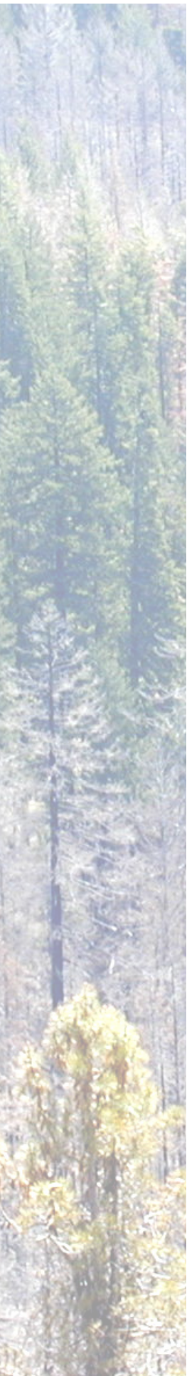
Figure 3. High-intensity burn: Trees are killed, foliage and litter on forest floor are consumed, and the soil surface is bare and subject to erosion. Log terraces and straw mulch would disperse water and reduce erosion at this site. (Fountain Fire)