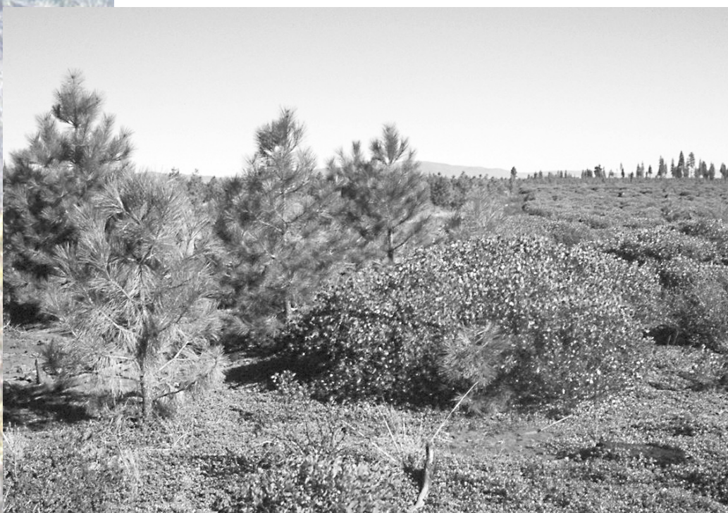
Figure 6. Reforestation. Weed control is important to ensure successful regeneration of trees. At this study site, brush competition was controlled on the left, where 20-year-old trees are now 20 feet tall. On the right, brush was not controlled, and pine survival was low and tree growth stunted.

Forest Growth. Weed control gives trees a few years' advantage over competing vegetation, allowing trees to predominate on the site once again. In intensively managed ponderosa pine stands on good timber sites, merchantable trees 20 inches