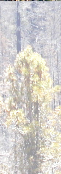
Figure 2. Forest floor of moderate-intensity burn 1 year after the fire. Although needles and litter were consumed by the fire, needles cast by surviving trees cover and protect the soil surface. (Megram Fire)